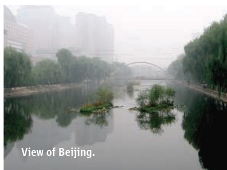
View of Beijing.

Concern has arisen about air quality during planning for the August 2008 Olympic Games in Beijing, China, as so many of the scheduled competitions are intensely aerobic, and summer pollution levels in Beijing can be high. Both the national and municipal governments there have introduced a range of measures to reduce locally generated air pollution, a strategy almost certain to have a positive effect. However, air pollution can also arise